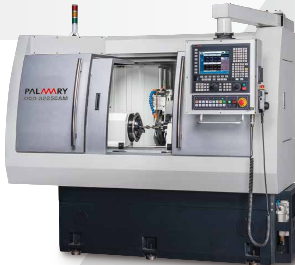
[ OCD-3225CAM ]

The table slideway is lubricated by an advanced automatic hydro-static lubrication system. This provides extremely smooth movement.