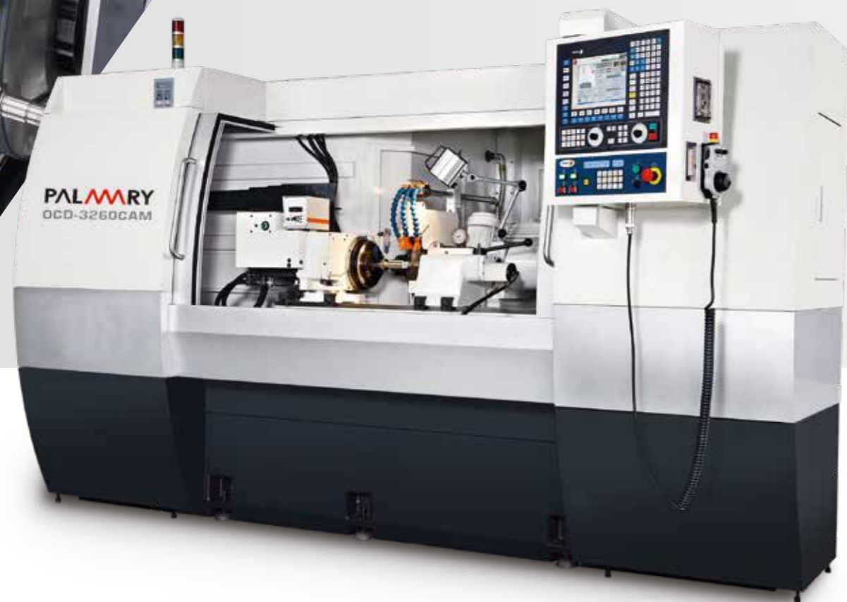
[ OCD-3260CAM ]