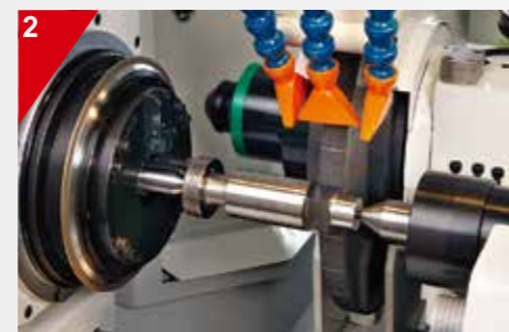
DIAMOND ROLLER DRESSING DEVICE (optional)