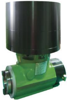
IK-N90+N95 Application for Patent