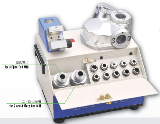
三刃專用 for 3 Flute End Mill