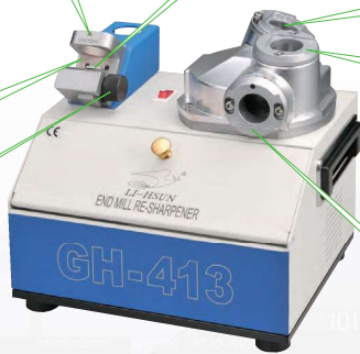
2. 研磨後斜角 20° NO.2 FOR SCREW RADIAL ANGLE 20°