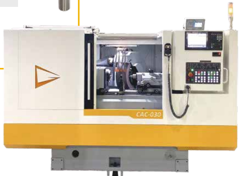
Hydrostatic Cylindrical Angular Grinding Machine